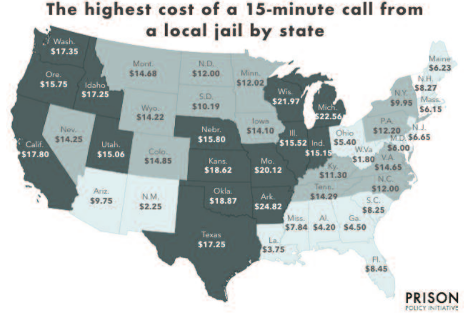
Figure: As of November 2018, in more than half of states, the highest in-state 15 minute call costs more than $10, and in 15 states it costs over $15. Alaska, Connecticut, Delaware, Hawaii, Rhode Island, and Vermont do not have jails and are therefore not displayed. (Source: Peter Wagner and Alexi Jones. "State of Phone Justice," Prison Policy Initiative. February 2019, https://www.prisonpolicy.org/phones/state_of_phone_justice.html)

As the cost of phone calls for the non-incarcerated population nears zero, prison telephone providers charge exorbitant consumer rates. These rates "can increase the cost of families staying in touch...by as much as 40%," according to the Federal Communications Commission (FCC).<sup>4</sup> Former FCC Commissioner Mignon Clyburn called the soaring cost of prison phone rates a civil rights issue, preventing the 2.7 million children across the country with at least one incarcerated parent from being able to speak to those parents.<sup>5</sup>