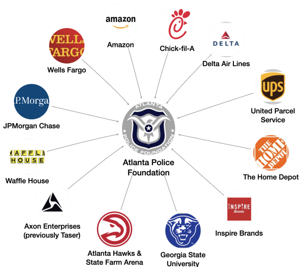
Map of corporate supporters of the Atlanta Police Foundation created by LittleSis. 93